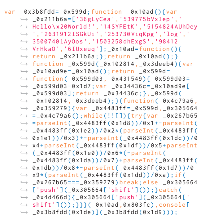
Listing 4. Obfuscated source code produced by applying the JavaScript Obfuscator in its default configuration.

It is no surprise that certain obfuscating transformations will thwart our approach to semantic malware detection, as CodeQL would not be able to model the malicious information flows specified. However, we argue that obfuscated code should be deemed suspicious per se, and that we should detect